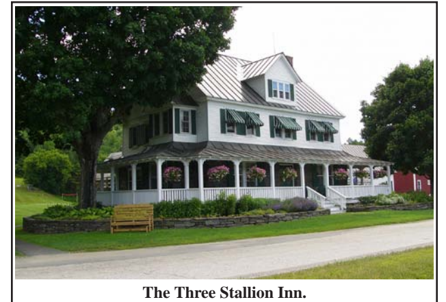
The Three Stallion Inn.

The Three Stallion Inn is located at 665 Stock Farm Rd., off Rt. 66 near I-89, exit 4, in Randolph, VT. For further information or to arrange a stay call (802) 728-5575, e-mail info@threestallioninn.com or visit www.threestallioninn.com .